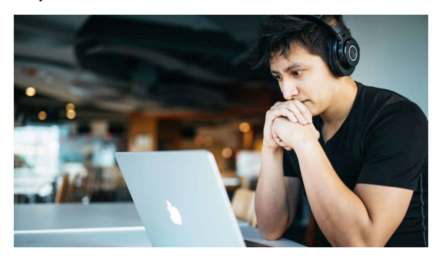
3. Writing Skills: Write Persuasive Speeches

2. Reading Comprehension Strategies and Skills: Comprehend Non-fiction Texts and Proposals